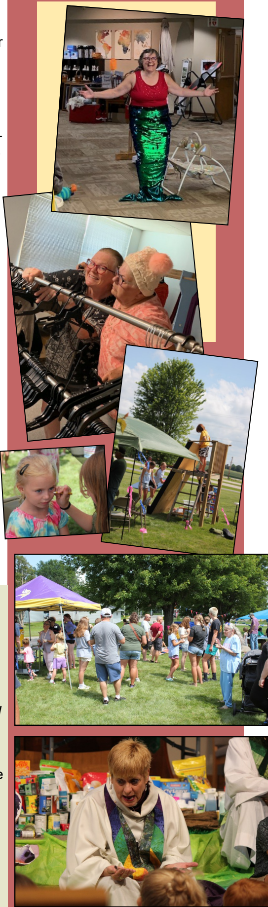
Recently seen around CLC...

Donations needed for African Dresses: If anyone has seam binding or fabric they'd like to donate we will take that.