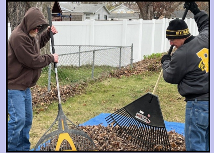
Church clean up