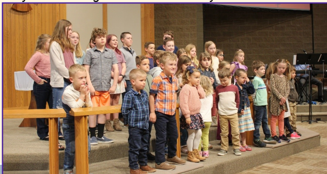
Sunday School sang on their final Sunday.