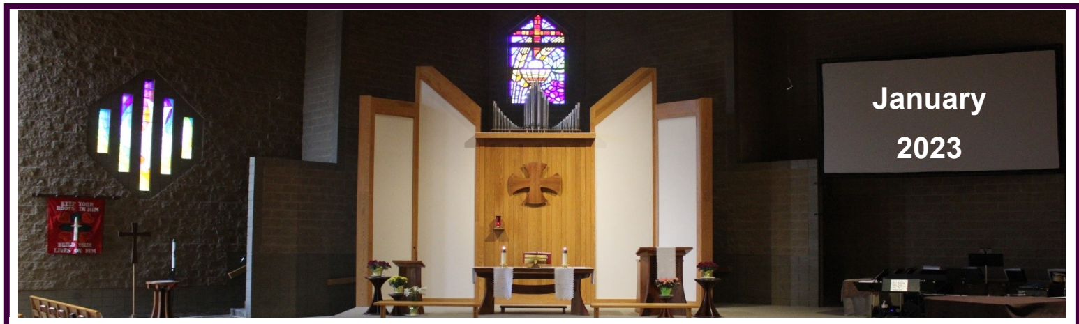
BEING DISCIPLES: MAKING DISCIPLES

Jesus called disciples to follow him and so to learn to share in his identity and in his mission, and then to go and make disciples, and teach them in turn to make disciples. There is a dynamic of following, of being a disciple, and of being sent out, as apostles, or sent ones, to make disciples.