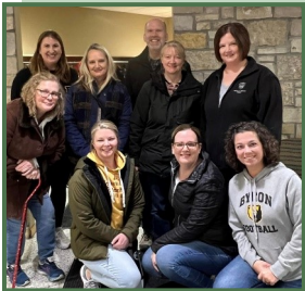
Confirmation Kids at the Food Pack

Sunday, January 1, 9am - Service/Comunion