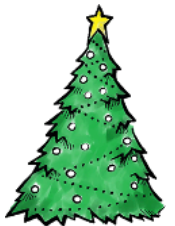
Card Making in Sept