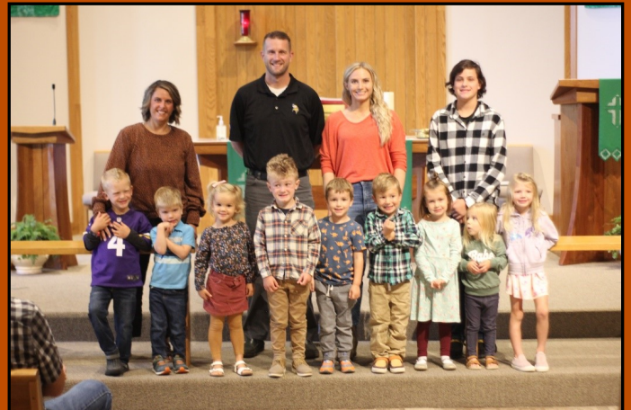
RALLY SUNDAY PICTURES