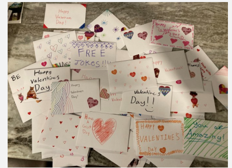
Cards made from a Confirmation service project event.