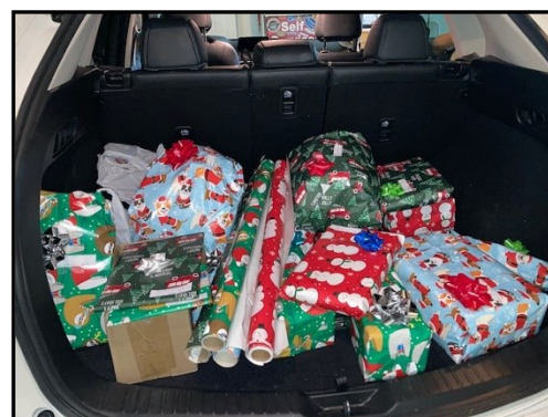
Confirmation kids purchased and wrapped gifts for 2 area families in need.